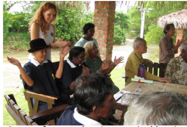
Guests from Bahagia Hospital having afternoon tea, fun and games with EFT.

EFT is now offering an extensive CAS programme for IB trips to The Roots education centre in Perak.