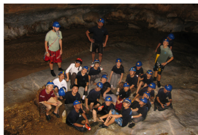
Students particularly loved exploring the subterranean river!

July 2010 saw the first ever EFT trip with Fairview International School, Malaysia. MYP groups from both Penang and KL joined us for a four day 'Culture and Conservation' trip at The Roots, Ipoh. We look forward to working together again in the future!