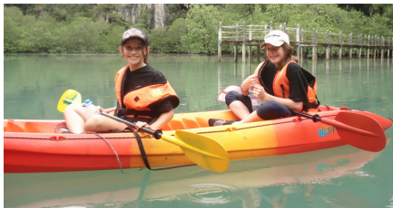
Kayaking means we can get close to wildlife without causing any disturbance!

Kinta Nature Park is home to 130 species of birds and is one of the largest heronries in Malaysia. Kayaking on the lake offers an up-close and personal experience to the diverse wildlife of the park. This program is suitable for students Grade 10 and above. Higher level fieldtrips may also incorporate freshwater surveys and bird diversity surveys.