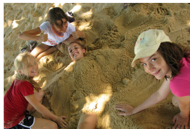
Students at play on Melina Beach!

For nature-lovers, you would love our new 10-day Langkawi, Belum & Ipoh trip as we bring you zooming through the canopy of the ancient rainforest of Langkawi, snorkelling in the turquoise water of Pulau Payar Marine Park, hornbill watching and elephant spotting in the submerged valley of Belum/Temengor rainforest, and bird watching in the Kuala Gula mangrove reserve.