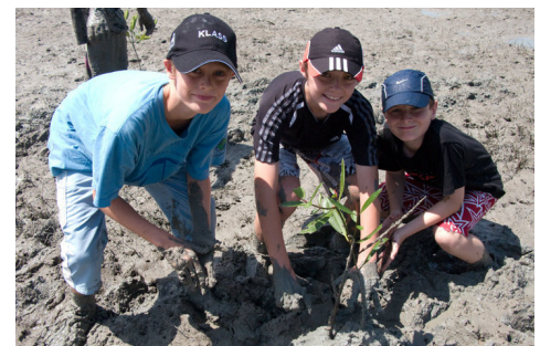
Years 7s planting mangrove saplings

...And they're coming back for more! Year 7 students from Alice Smith School KL got their hands (very) dirty on their first trip with Ecofieldtrips to The Roots in June. Fun was had by all planting mangrove saplings knee-deep in mud, crawling through caves and learning the hard way about iodine stains from giant millipedes!