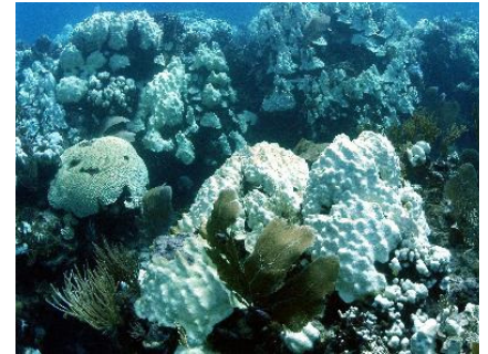
Bleached coral is stony white

The worst coral bleaching event in recorded history has affected reefs worldwide in 2010, with Tioman Island sited as one of the most seriously hit areas.